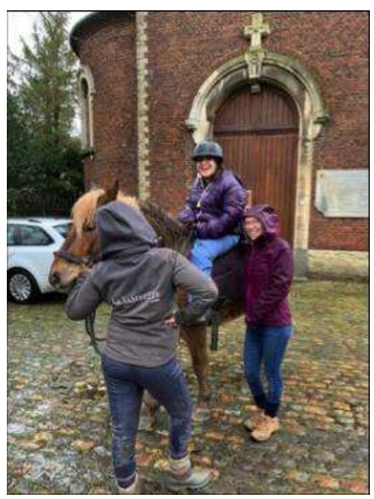
Total Project Cost: € 2.177,00