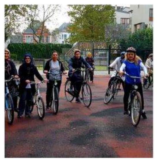
Total Project Cost: € 7.470,56

URL: <a href="https://www.facebook.com/AFBT-asbl-852919158079201">https://www.facebook.com/AFBT-asbl-852919158079201</a>