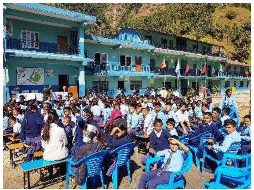
Total Project Cost: € 5.700,00